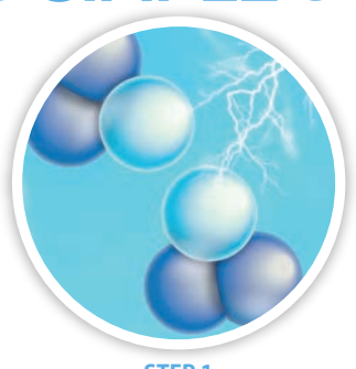
Oxygen (O<sub>2</sub>) from the air is safely turned into O<sub>3</sub>, then infused into ordinary cold tap water.