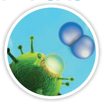
SAO is attracted to germs, soils, and bacteria and quickly eliminates contaminants.